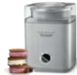
Ice Cream Makers

Cuisinart offers an extensive assortment of top quality products to make life in the kitchen easier than ever. Try some of our other countertop appliances and cookware, and Savor the Good Life®.