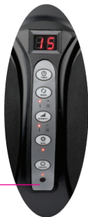
Red Indicator Light